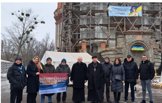
At the Greek Catholic Cathedral of St. Nicholas

You will be pleased to know that even in this complicated situation, Scouting is continuing. This year again we will be hosting Ukrainian scouts in Italy, we have received requests from 20 Ukrainian scout groups. We hope to be able to satisfy all of them. If you would like to help MASCI with this project, please contact: