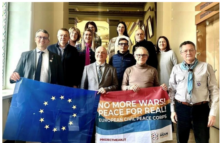
At Kharkiv University with the Rector