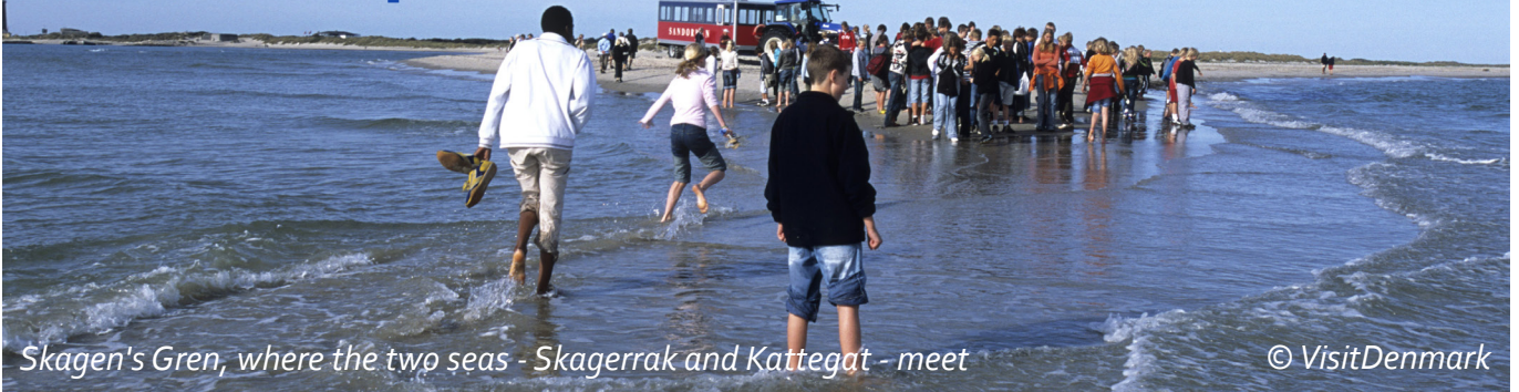
Skagen's Gren, where the two seas - Skagerrak and Kattegat - meet